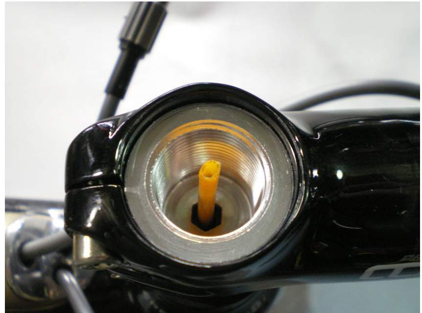
A. & B.